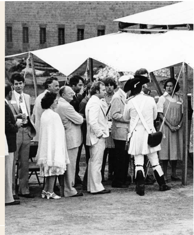
ASSE Savannah Chapter Charter Celebration: 1980

Book before September 3 rd to guarantee rate.